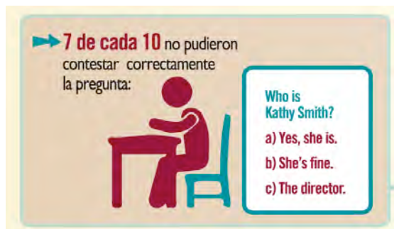
Figure 3. An example of a test item from the EUCIS.

It is unclear what linguistic ability is being tested, but it is presumably reading comprehension. We might say that for Figure 3 the best answer would be: (d) I have no idea who Kathy Smith because you haven't given me any context to interpret what you are asking me. Despite their claim that the EUCIS tests communicatively in everyday social situations, from the examples provided it is difficult to see how there is any context within the test that constitute "social situations" that would be recognizable to students taking the test.