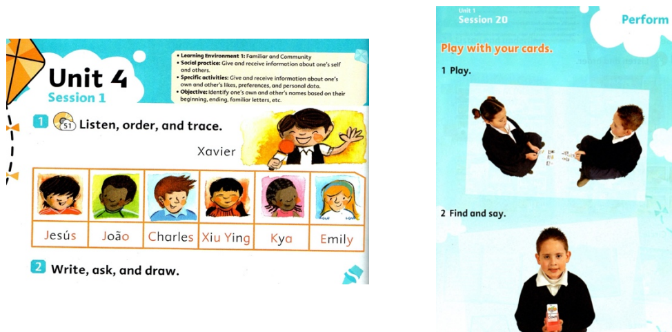
Figure 3. Examples of illustrations and photos in Textbook 3

In Textbook 3, the photos are used to present the finished products and in some lesson activities, whereas illustrations are only used in lesson activities. This book has a self-evaluation section with no images in a review section. The characters in the photos are limited and appear in all the units while characters in the illustrations include children and adult human-like characters. As in the other books, there are no main characters appearing throughout the book, but some appear more than once in some units.