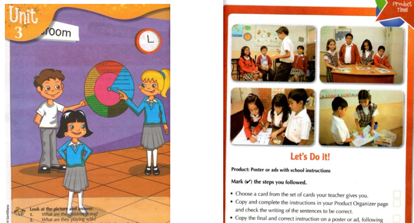
Figure 2. Examples of illustrations and photos in Textbook 2

children and adult human-like characters as well as some anthropomorphic animals which were not considered for analysis given these types of illustrations do not appear across all three books. There are no leading characters in the illustrations, although some characters reappear in some units.