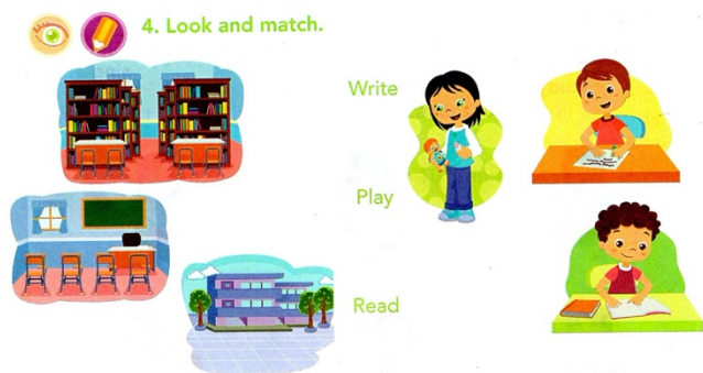
Figure 1: Examples of illustrations and photos in Textbook 1

Images are used in a slightly different manner in each book. In Textbook 1, the photos are used to present the units and to display the process of task products while illustrations are used for lesson activities and evaluations. In the photos, there is a limited number of characters who appear throughout the book. The illustrations in this textbook include both children and adult human-like characters. There are no leading characters appearing in every unit. However, some characters are recurring in some units.