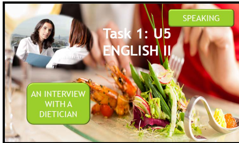
Figure 1: A screenshot of Task One in Unit Five

The following caption presents a sample of the initial instructions given to English II students to elaborate on their task . Its objective is to carry out an interview with a dietician. Additionally, teachers provide a sample of the product expected and enhance oral practice.