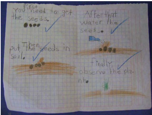
Figure 2: Connection with English and science class

For example, when studying literature and narratives in Spanish children learn about the basic story elements: setting, characters, plot, and so forth. Stories in English have these same elements, and teachers should be encouraged to draw on students' background knowledge to help them see these connections, and reinforce through English what has been learned in Spanish. Similarly, Figure 1 shows how for a kindergarten class the rules in English can help reinforce the classroom socialization process for young children just entering school. In this way, students are acquiring English, and simultaneously English lessons serve as a medium for learning in other areas.