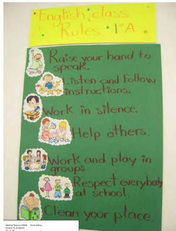
Figure 3: Connection with English and values and rules

Another cross-curricular connection that is of particular interest for the PNIEB is the question of the effect of early foreign language learning for literacy acquisition. In this study, we were interested in detecting how exposure to English literacy might affect their development of reading and writing in Spanish, especially for children in grades K-2 (ages 4 to 6). The early acquisition literacy in two languages is referred to as biliteracy development .